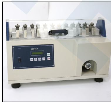
Front View Of Upper Material