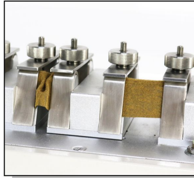
Clamping the samples