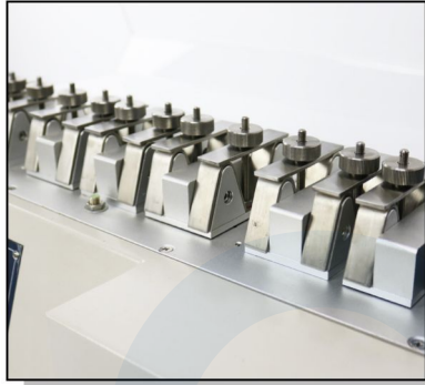
12 group of fixture