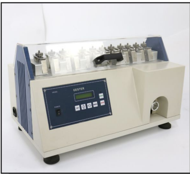
Side View Of Upper Material