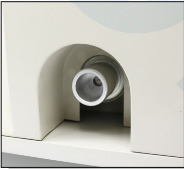
It is to adjust distance of clamps for placing samples.