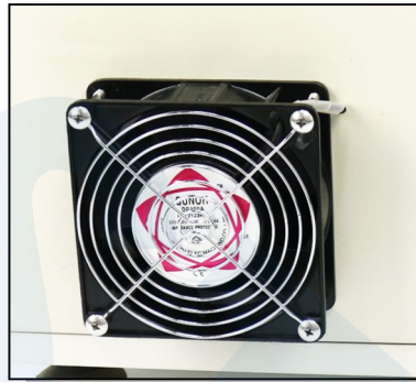
Be used for adjusting the temperature of inner tester, ventilation for heat elimination environmental oriented, without noise.